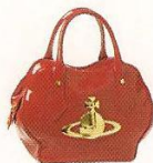
WEAR A punky Vivienne Westwood bag.

mysterious jars of Hix Strangebrew—gins infused with seasonal flavors—lining the shelves (66-70 Brewer St., W1).